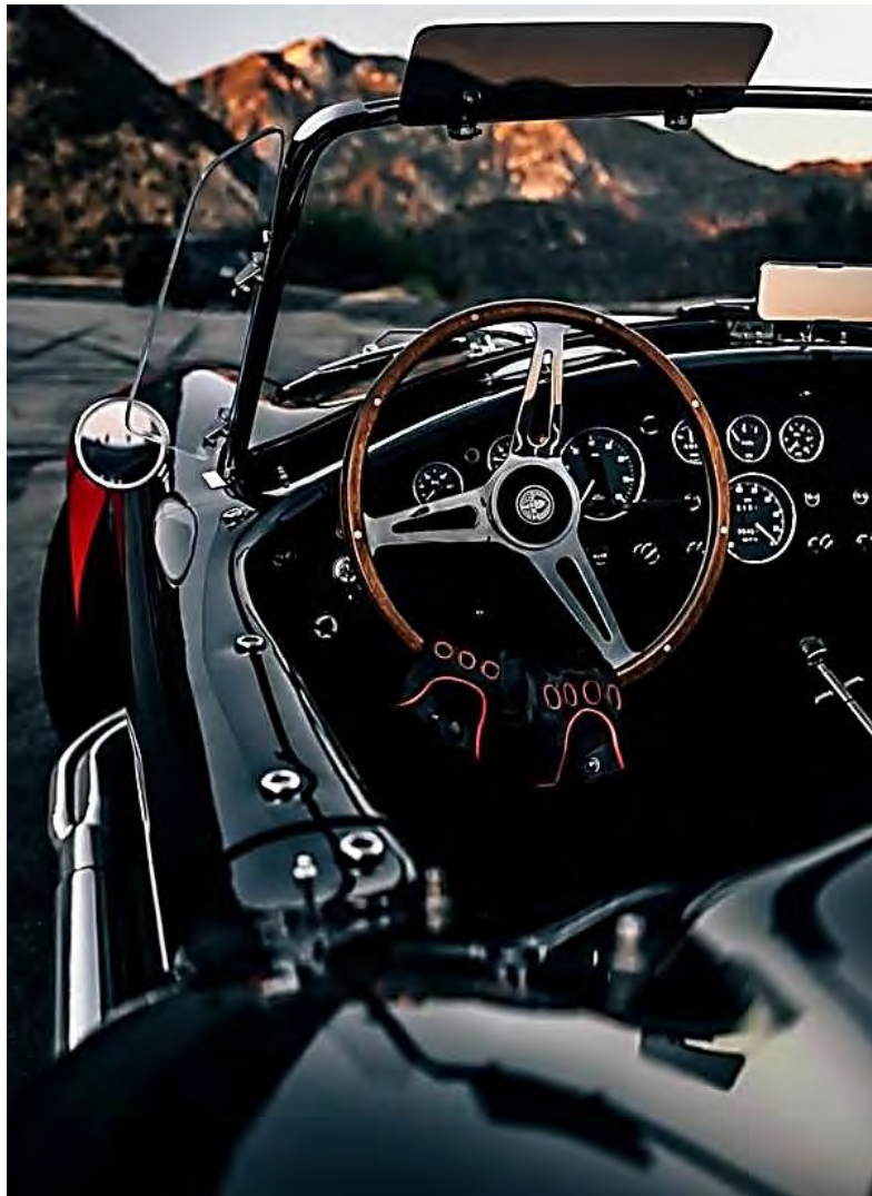
Cars, motorbikes & Stars of the Golden Era